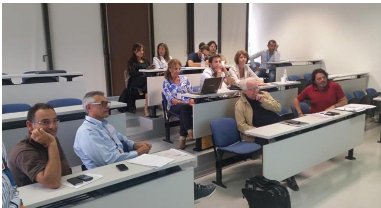
Figure 1 - LIFE BITMAPS Kick off meeting Sep. 16 2016 - LFoundry - Avezzano (AQ)

LIFE BITMAPS consortium is composed by four partners. The consortium agreement was finally defined by partners during the kick off consortium meeting held in Avezzano (AQ) on 16 Set 2016.